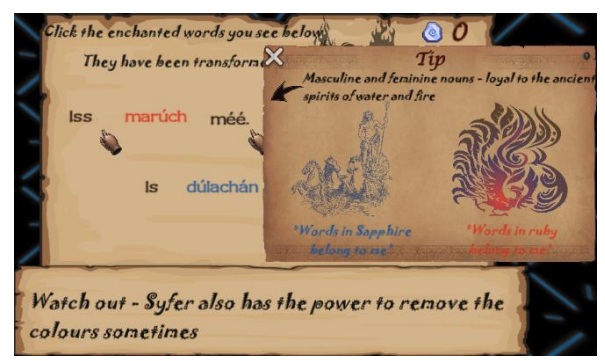
Figure 2 Example of a cipher and noun gender colour coding

In this game we encourage noticing of spelling orthography by introducing cipher errors into the stories. Most cipher errors are not errors which a learner would naturally make e.g., swapping the first half of a word with the second half, doubling the last letter, or removing all vowels. These types of errors encourage noticing, are relatively easy to spot, and minimise the risk of familiarising the learners with misspellings. In Figure 2 we have an example of the "Double Tail" cipher which doubles the last letter of a word, e.g. Is 'is' has become Iss and mé 'me' has become méé .