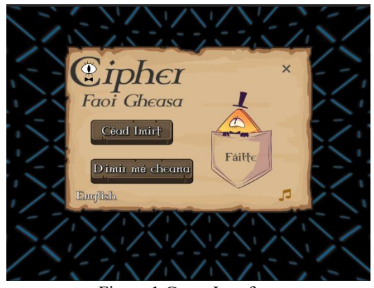
Figure 1 Game Interface

The game world is a magical one in which ancient evil spirits are attempting to deny access to the ancient mythological tales by placing them under a spell, to cause people to lose their memory of their past. The player's challenge is to decipher these spells in order to restore the tales before they are sealed and lost forever. There are many different spells (ciphers) and stages before all the evil spells can be lifted and the story is restored.