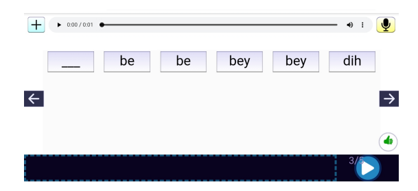
Figure 2: Final version of the app

to it and clicking on the associated plus button. The app and databases were stored in a laptop accessed remotely by a tablet with wifi.