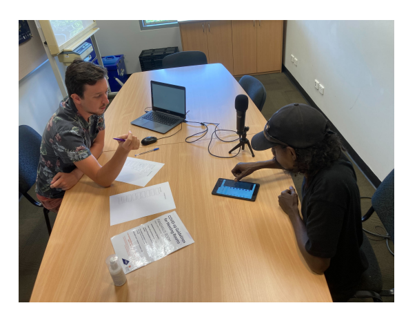
Figure 6: Picture of a participant using the app

No more participants were available for the time for this project. However, to sustain this work in the future, we deployed it in a laptop to be brought to the community by future scholars or language workers, as soon as COVID-19 restrictions are eased.