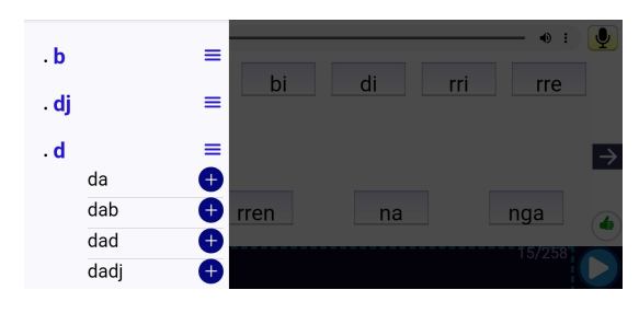
Figure 4: Updated syllable search mechanism