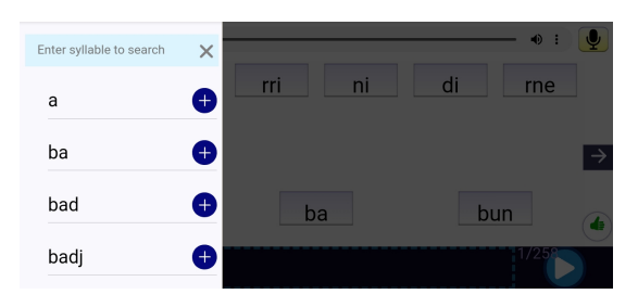
Figure 3: Initial syllable search mechanism