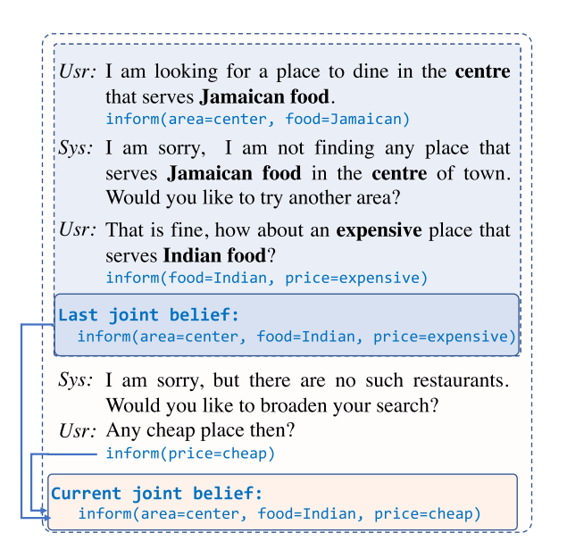
Figure 1: An example dialogue for illustration. Turn belief labels are provided based on turn information, while the joint belief captures most updated user intention up to the current turn.

Although these RNN based methods model dialogue in turn by turn style, they usually feed the whole turn utterance directly to the RNN, which contains a large portion of noise, and result in unsatisfactory performance (Liao et al., 2018; Zhang et al., 2019b). More recently, there are works that directly merge fixed window of past turns (Perez and Liu, 2017; Wu et al., 2019) as new input and achieve state-of-the-art performance (Wu et al., 2019). Nonetheless, their capability of modeling long-range dependencies and doing reasoning in the interactive dialogue process is rather limited. For example, (Wu et al., 2019) performs gated copy to generate slot values from dialogue history. Although certain turns of utterances are exposed to the model, since the interactive signals are lost when concatenating turns together, it fails to do in-depth reasoning over turns.