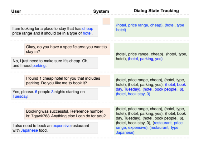
Figure 1: An example of dialog state tracking for booking a hotel and reserving a restaurant. Each turn contains a user utterance (grey) and a system utterance (orange). The dialog state tracker (green) tracks all the < domain, slot, value > triplets until the current turn. Blue color denotes the new state appearing at that turn. Best viewed in color.

Virtual assistants play important roles in facilitating our daily life, such as booking hotels, reserving restaurants and making travel plans. Dialog State Tracking (DST), which estimates users' goal and intention based on conversation history, is a core component in task-oriented dialog systems (Young et al., 2013; Gao et al., 2019a). A dialog state consists of a set of < domain, slot, value > triplets, and DST aims to track all the states accumulated across the conversational turns. Fig. 1 shows a dialogue with corresponding annotated turn states.