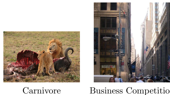
Figure 2: SUMO illustrations

to WordNet: 3,593 equivalent, 10,712 where the WordNet synset subsumes the SUMO concept, 88,065 where the SUMO concept subsumes the WordNet concept, 293 where the negation of the SUMO concept subsumes the WordNet synset and 6 where the negation of the SUMO concept is equivalent to the WordNet synset. According to the mapping, synset 02076196-n 海豹 azarashi “seal”, shown in Figure 1 is subsumed by the SUMO concept ⟨⟨Carnivore⟩⟩. There is no link between seal and carnivore in WordNet, which shows how different ontologies can complement each other.