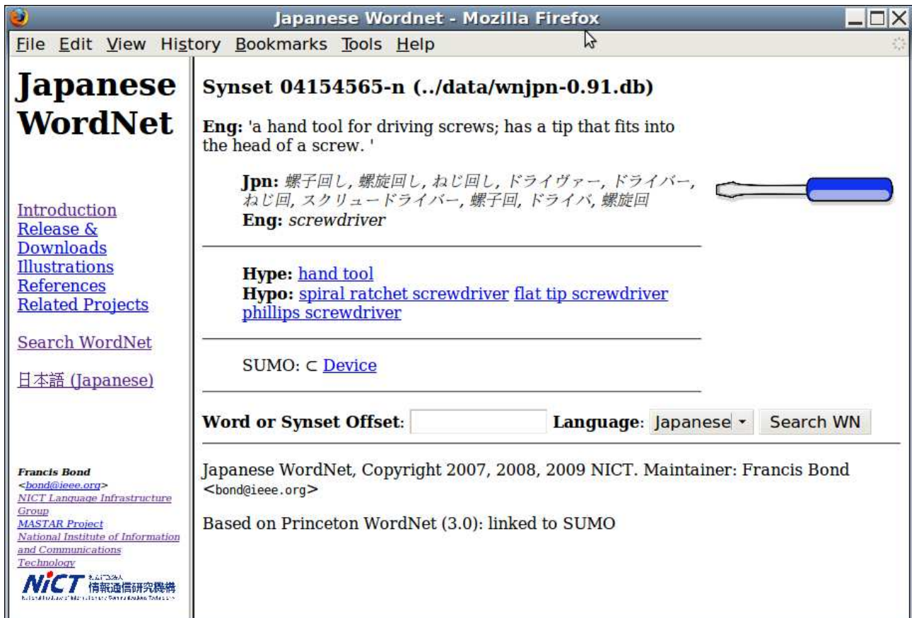
Figure 4: Web Search Screenshot