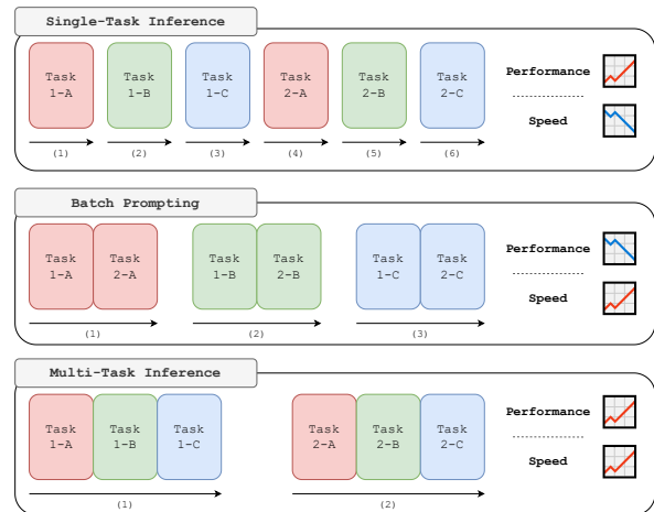
Figure 1: Comparison of the three inference methods for handling tasks composed of three sub-tasks: SINGLE-TASK INFERENCE, BATCH PROMPTING, and MULTI-TASK INFERENCE. MULTI-TASK INFERENCE shows reliable performance as SINGLE-TASK INFERENCE and provides faster speed as BATCH PROMPTING (Cheng et al., 2023).

Large language models (LLMs) capable of following instructions have demonstrated impressive performance across a wide range of tasks (Xu et al., 2023; OpenAI, 2023; Anil et al., 2023; Tunstall et al., 2023; Wang et al., 2023a). However, since LLMs are trained to follow a single instruction per inference call, it is questionable whether they also hold the ability to follow complex instructions that necessitate handling multiple sub-tasks (Yang et al., 2018; Geva et al., 2021; Cheng et al., 2023). Moreover, current evaluation resources are either confined to measuring the LLM’s capability in following one-step instructions (Li et al., 2023; Chiang