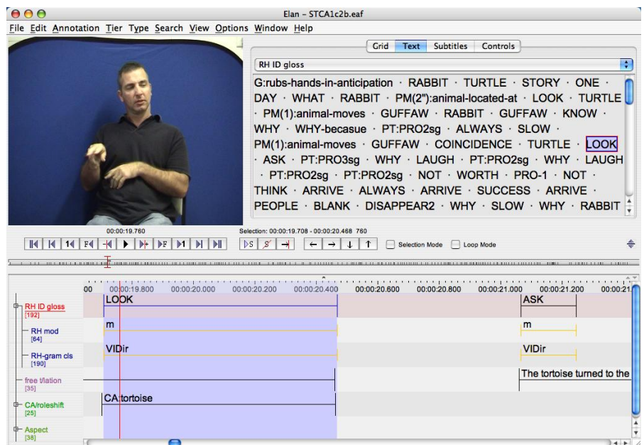
Figure 2: A screen grab from ELAN—the ID-gloss LOOK is tagged with 'm' (for 'modified') on the RH mod tier and 'VIDir' (for grammatical class 'Directional Indicating Verb') on the RH-gram cls tier.

The corpus is being annotated digital video annotation software called ELAN (<u>E</u>UDICO – <u>Eur</u>opean <u>Distributed Corpus – linguistic annotator</u>) (Hellwig et al. , 2007). The software allows for the precise time-alignment of annotations with the corresponding video sources on multiple user-specifiable tiers. It allows one to create, edit, visualise and search annotations for video data. It supports display of video with its annotation; time linking of annotations to media streams; linking of annotation to other annotations; unlimited number of annotation tiers defined by users; different character sets; export of annotations as tab-delimited text files and a complementary ability to import text file annotations. Relevant metadata for the digital recordings is appended to media files. The following screen-shot of an opened ELAN annotation file shows an ID-gloss tier with several daughter tiers that exemplify the type of vertical tags, discussed above.