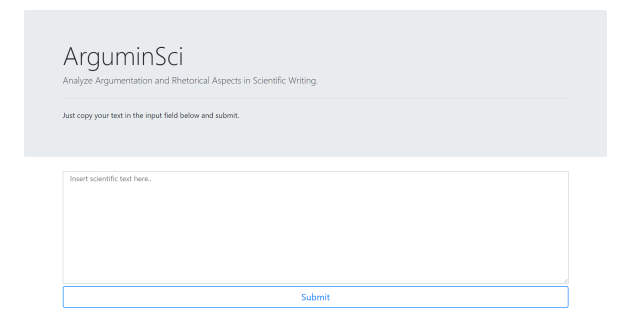
Figure 2: The ArguminSci web application offers a simple interfaces for easy analysis of scitorics .