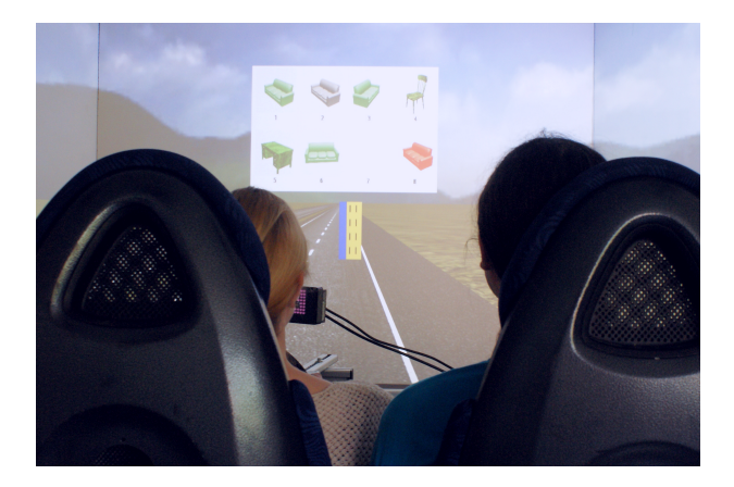
Figure 1: Driving simulator with 2 subjetcs and a stimulus. From left-to-right, top-to-bottom, the stimulus depicts a green sofa, a grey sofa, a green sofa, a green chair, a green desk, a green sofa, a blank space, and a red sofa. #1 was the target.

Twenty pairs of Saarland University students participated in our experiment, with mean age 23.0 (SD=4.1). Twenty-one participants were women and the rest were men. We paid the students 10 euros each for their participation.