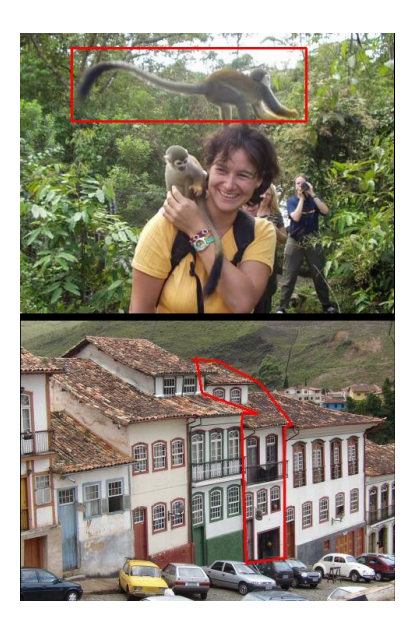
Figure 1: Experimental scenes depicting an animate target (above) and an inanimate one (below)

Materials Experimental materials consisted of 40 target objects, each presented in a different scene. These scenes have been semi-randomly selected from the larger set of images, illustrating aspects of everyday life, used to elicit REs in the ReferIt game (Kazemzadeh et al., 2014). Our selection contains scenes that have at least one other object of the same type as the target, so as to elicit more than one word descriptions. To present participants with a wide range of objects, 20 scenes had animate targets and 20 scenes had inanimate ones. In each scene, the target was highlighted with a red bounding box, see