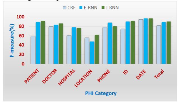
Figure 2: Performance comparisons between RNN and CRF for all identified PHI types

Table-4 shows the impact of each word embedding techniques with Elman architecture. The word vectors obtained from the RNNLM performed well on syntactic part. It is obvious because the word vectors in the RNNLM are directly connected to a non-linear hidden layer. The CBOW architecture works better than RNNLM for the syntactic tasks, and about the same on the semantic tasks. The CBOW model follows the distributional hypothesis while training which enables to outperform over the other word embedding techniques.