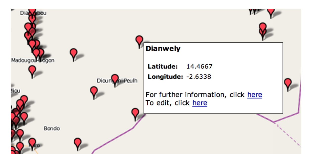
Figure 3: Clicking on a pin