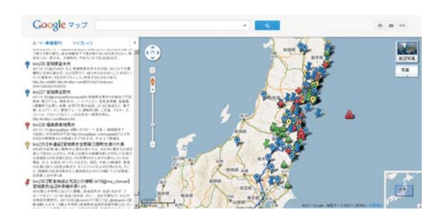
Figure 3: The Supply Request Map of #99japan.

By the project activity used the rescue map and the supply request map (Figure 3), The project had reporting and supporting activities more than 200 points on the rescue and supply request maps, respectively, in about three weeks until early April.