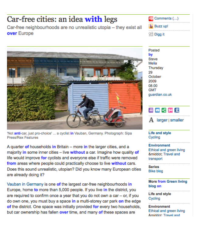
Figure 2: Screenshot of color activity for prepositions, cf. http://purl.org/icall/werti-color-ex

The input enhancement used for lexical classes is the default set of activities provided by WERTi. In the simplest case, Color , all automatically identified instances in the web page are highlighted by coloring them; no learner interaction is required. This is illustrated by Figure 2, which shows the result of enhancing prepositions in a web page from the British