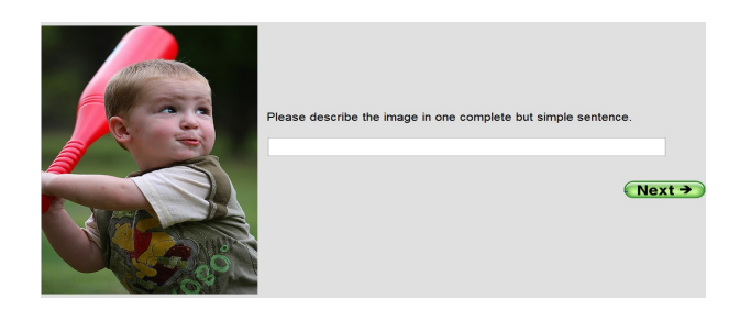
Figure 1: Screenshot of the image annotation task.

MTurk setup We asked Turkers to write one descriptive sentence for each of ten images. An example annotation screen is shown in Figure 1. We