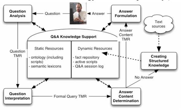
Figure 1. The top-level architecture of the system.

Our question answering system consists of four main and one auxiliary processing modules (see Figure 1). The question analysis module takes as input the text of a user's question and produces its text meaning representation (TMR, see below for an illustration) that contains representations of instances of ontological concepts to which the input refers plus speaker-attitude and communicative information. The TMR is input to the question interpretation module that interprets the question in terms of its type and transforms it into a formal query against the fact repository or the ontology (see below). (Note that the format of the database query is the same as that of the auestion TMR. In general, all internal representations of knowledge in our system, both elements of knowledge support and results of actual processing, are compatible with the content and format of the ontology and fact repository.)