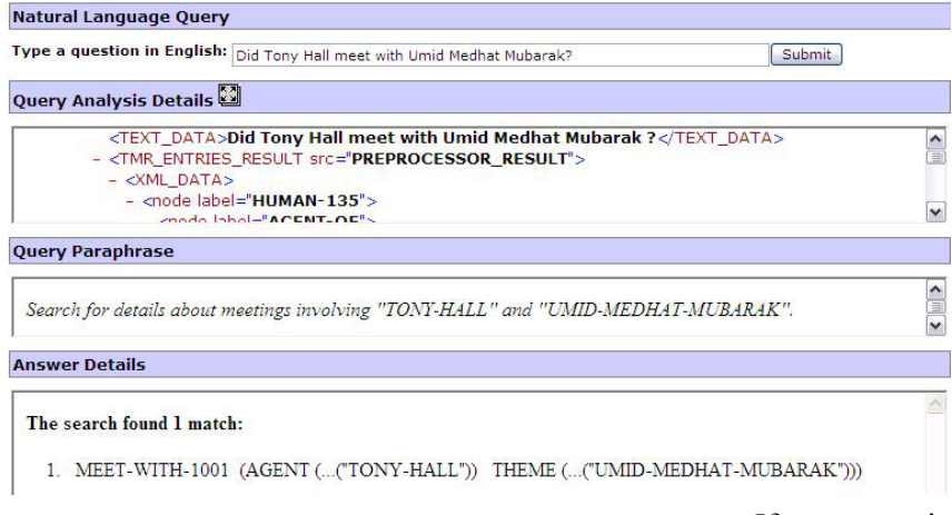
Figure 6: Querying about a known event.

future, we will also generate a numerical value reflecting the confidence level of the inferences and sub-inferences). The supporting reasoning chain is also displayed. We will now use this example to discuss the three main question answering modules.