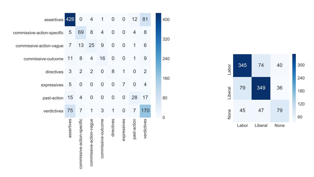
Figure 2: Confusion matrix for speech act and target party classification tasks.