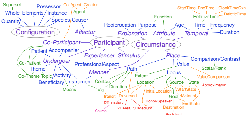
Figure 1: Preposition supersense hierarchy (from Schneider et al., 2016). Top-level categories are circled and subcategories radiate outward.

1/3 fewer semantic labels, reducing somewhat the practical concern of sparse data. Here we also discuss challenges and tradeoffs inherent in the proposed approach. We have begun testing the workability of this proposal empirically by annotating data in multiple languages, with disambiguation experiments to follow.