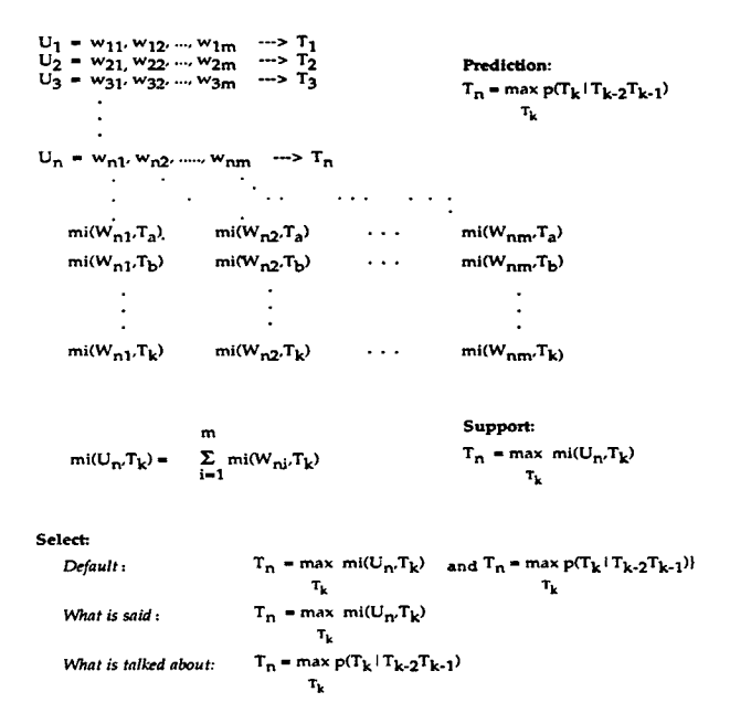
Figure 3: Scheme of the Predict-Support Algorithm.

Using the probabilities obtained by the trigram backoff model, the set of likely topics is actually a set of all topic types ordered according to their likelihood. However, the original idea of the topic trees is to constrain topic shifts (transitions from a node to its daughters or sisters are favoured, while shifts to nodes in separate branches are less likely to occur unless the information under the current node is exhaustively discussed), and to maintain this restrictive property, we take into consideration only topics which have probability greater than an arbitrary limit p.