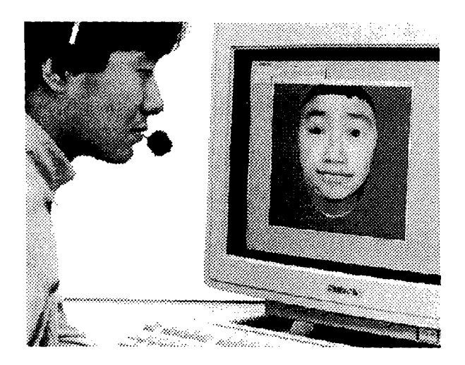
Figure 2: Dialogue Snapshot

the system incorporates 16 muscles and 10 parameters, controlling mouth opening, jaw rotation, eye movement. cyclid opening, and head orientation. These 16 muscles were determined by Waters, considering the correspondence with action units in the Facial Action Coding System (FACS) [Ekman and Friesen. 1978]. For details of the facial modeling and animation system, see [Takeuchi and Franks, 1992].