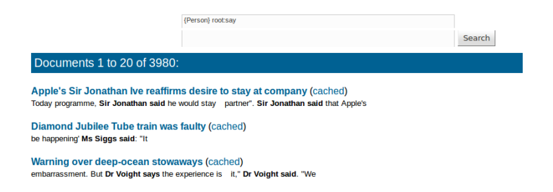
Figure 5: Example Semantic Search Results

motes reuse and repeatability of experiments.