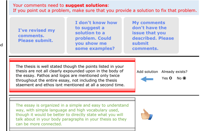
Figure 2: Screenshots of original review interface (left) and new instant feedback interface (right). For readability, the review interface shows only one comment prompt and its associated rating prompt. The instant feedback interface displays a solution feedback message and three possible reviewer reactions (top), and highlights problem-only (middle) and solution (bottom) comments.

natural language processing is used to automatically predict whether a solution is present in each peer review comment (Figure 1). If not enough critical comments are predicted to contain explicit solutions for how to make the paper better, students are taken from the original review interface to a new instant feedback interface which scaffolds them in productively revising the original peer reviews (Figure 2).