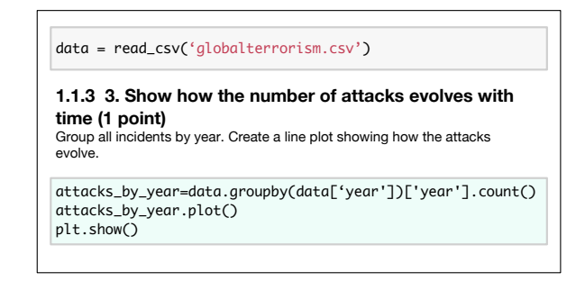
Figure 2: This example nbgrader problem prepared by an instructor prompts the student to fill in the blue colored cell with code to perform operations on previously loaded data. We leverage such notebooks with embedded solutions, posted on Github, to create a high quality dev and test set for JuICe.

While existing large scale NL-code datasets have leveraged noisy online code repositories/forums to create training sets, obtaining a human curated test set has always been prohibitively expensive, and is typically done only for simple single line NL to code tasks. For our dataset, we take advantage of programming assignments written in Jupyter notebooks to build a high quality dev/test set. Specifically, we collect 1,510 code context examples from assignments created with nbgrader (Hamrick, 2016), and mine an additional 2,215 examples from in-class exercise notebooks.