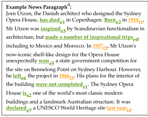
From a news report in The Telegraph .