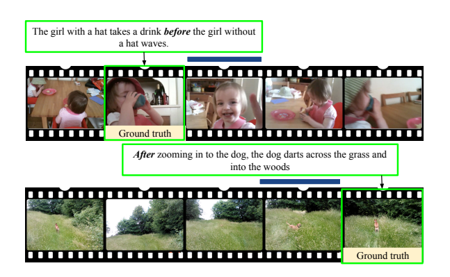
Figure 4: Moment localization predictions on TEMPO - HL using our model. In addition to the localized query, we show the selected context segment (blue line) that our model considers when localizing the query.

Table 7: Comparison of different methods to localize context fragments (e.g., the text "she bends down" in the sentence "the girl talks after she bends down"). We compare localizing fragments with the MLLC model to localizing fragments with the latent context considered when localizing the whole query.