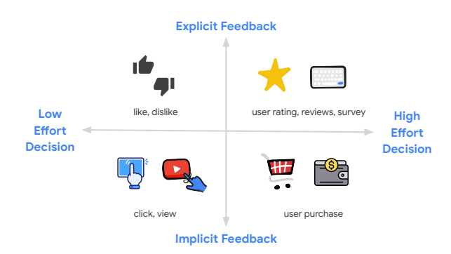
Figure 1: Landscape of recommender systems tasks, with user feedback extent on the vertical axis and decision-making effort on the horizontal. For example, a user clicking on websites requires low effort and does not provide much feedback about the user's satisfaction. Conversely, a user rating and reviewing products requires more effort and provides better satisfaction signals.