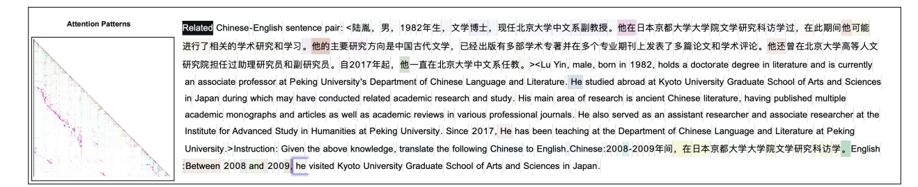
Figure 2: Average attention scores of the final layer of the Qwen-14B-Chat model. The darker the color, the higher the attention score assigned to that token. It is noteworthy that the model attends to "他" (meaning "he" in English) from the examples we extract when generating "he". Our examples successfully help the model in translating the zero pronoun "他" (meaning "he" in English).