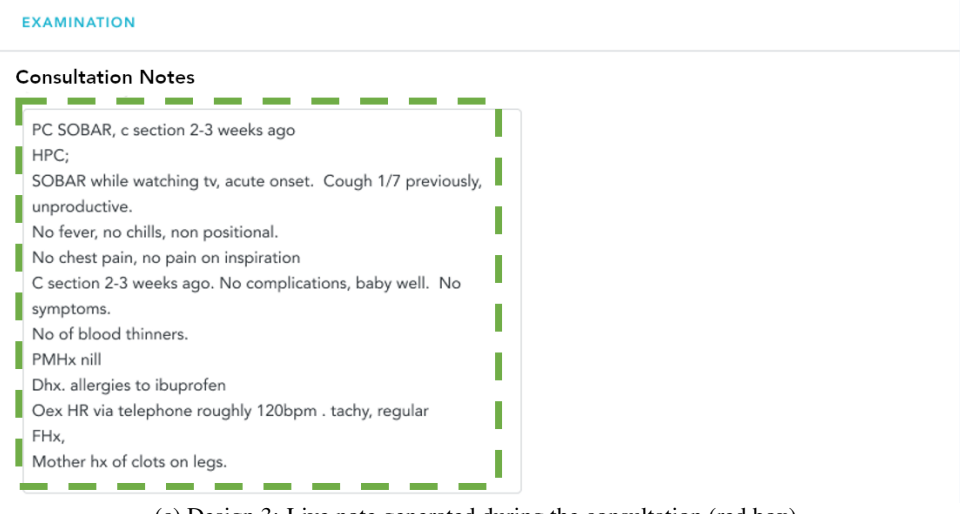
(c) Design 3: Live note generated during the consultation (red box).