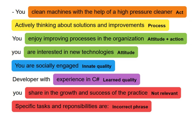
Figure 2: Examples of manually annotated sentences from the validation set (some were shortened), translated from Dutch and visualized with displaCy<sup>2</sup>.

extensive development phase. Development consisted of a series of pilots performed with a group of annotators on a separate sample consisting of job ads collected in 2014. We needed five rounds of annotation pilots to converge to a final version of the annotation guidelines that could be applied with sufficiently high inter-annotator agreement. In total, in our final dataset, 5,277 predicates and nouns were manually annotated by three annotators (Krippendorff's alpha ( \alpha ) = 0.77).