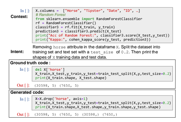
Figure 8: Another example with too many output.