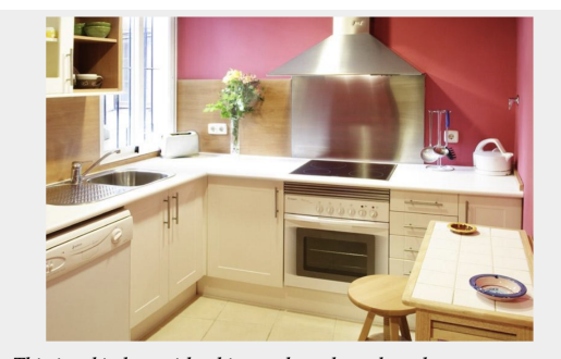
1. This is a kitchen with white cupboards and worktop.

We compare these results on PhotoBook with text-to-image alignment computed with the same method on two other datasets: (1) COCO (Lin et al., 2014),<sup>6</sup> which includes 5 captions per image provided independently by different annotators as shown in Fig. 2; here we do not expect to find significant differences in the level of descriptive-ness across the captions, and (2) Image Description Sequences (IDS, Ilinykh et al., 2019)<sup>7</sup> where one participant describes an image incrementally as shown in Fig. 3, by progressively adding sentences with further details; here we do expect a similar