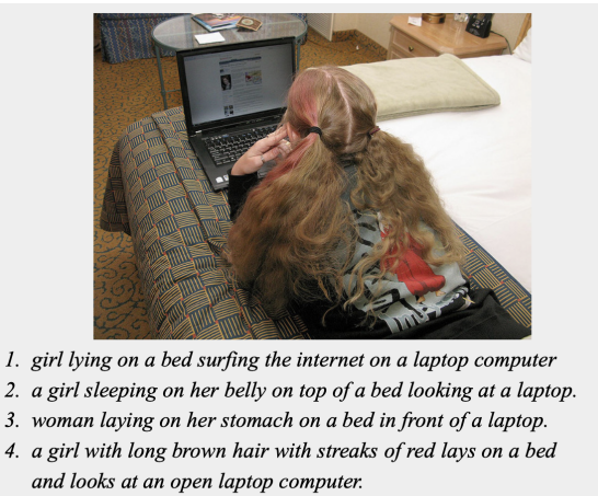
5. a young girl laying on a bed using her laptop.