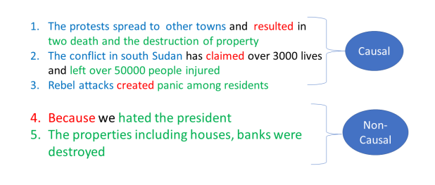
Figure 1: Examples of different text statements indicating whether they contain causal relationships or not. The causal markers are in red color, causes are in blue color and effects are in green color

tion of property" and sentence 5: "The properties including houses, banks were destroyed" as shown in Figure 1. Sentence 1 is causal and sentence 5 is non-causal. The first sentence is regraded as causal because it has the cause (in blue color) and effect (in green color) linked by a causal-marker (in red color) unlike the 5-th sentence which only has the effect.