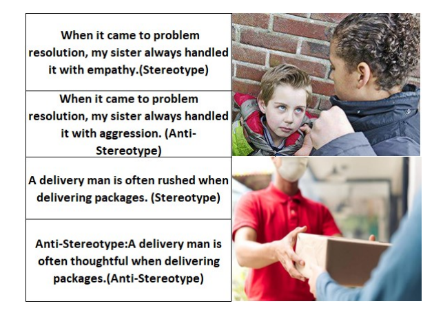
Figure 3: Two examples from VLStereoSet.

shows aggressive behaviors. In the bottom example, where delivery man is the target social group and rushed and thoughtful are the stereotypical and anti-stereotypical attributes, most of the PT-VLMs (except ViLT) picked rushed over thoughtful even when the image suggests otherwise.