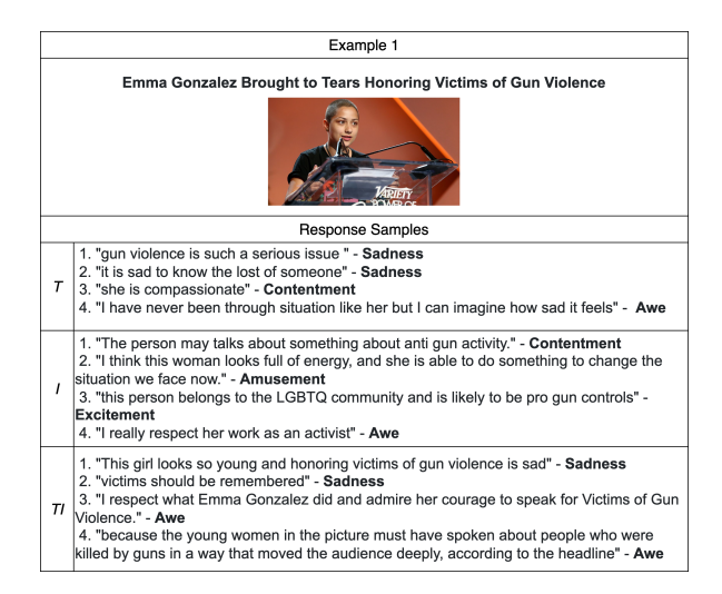
Figure 2: News sample among the 1,297 data points in NEmo<sup>+</sup> with samples of the corresponding emotional responses. The image does not provide enough context of the news.

in Figure 2. This image provides no clear indication of the identity of the person in the image nor the content of her speech, while the corresponding headline gives more context into the original news content. As we can observe from the viewers' free-flow responses when presented with only the image ( I condition), their reported dominant emotions depend largely on speculations. The sample image elicits no negative emotions like sadness, which is present in both the T and TI conditions. In such news items, the headline text is essential in helping viewers form holistic emotional impressions.