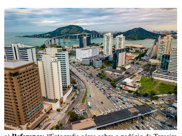
a) Reference: "Fotografia aérea sobre o pedágio da Terceira Ponte. A foto contém alguns prédios, um pedaço da Terceira Ponte e o fluxo de carros." CIDEr-D: "foto aérea aérea aérea da cidade de Florianópolis mostrando casas casas, mostrando casas casas. Ao fundo, algumas casas e casas." CIDEr-R: "Foto aérea de uma cidade de Brasília. Ao fundo, a céu azul."

In the last few years, there has been significant progress in image captioning thanks to the availability of a large amount of annotated data in relevant datasets (Agrawal et al., 2019; Chen et al., 2015; Gurari et al., 2020; Hodosh et al., 2013; Plummer et al., 2015). These datasets have in common multiple reference captions, which compre-