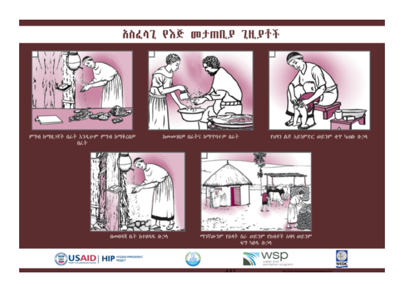
Figure 2: An Amharic illustration of translation of water, sanitation, and hygiene (WASH) guidelines in Ethiopia (USAID, 2009).