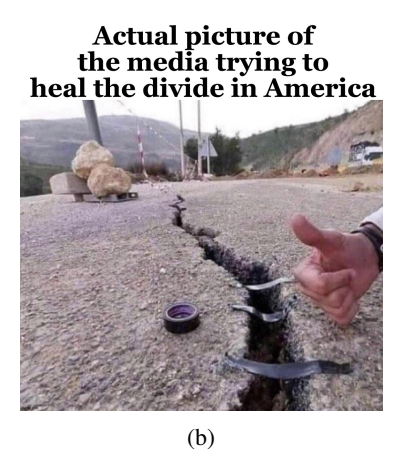
Figure 1: Examples of memes where the analysis of only the text (a) or both the text and image (b) are required to automatically detect the correct persuasion technique.

around identifying 22 rhetorical and psychological disinformation techniques in internet memes. These techniques cover a wide array of phenomenons like Causal Oversimplification , Exaggeration/Minimisation , Name Calling/labeling or Presenting irrelevant data (red herring) . For a full list of all categories, we refer to the task description paper (Dimitrov et al., 2021).