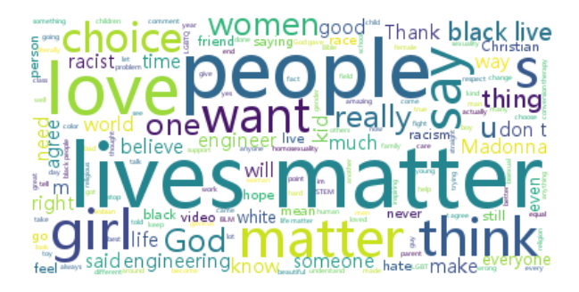
Figure 2: A word cloud image generated from the text marked with "Hope speech" in the English training data set provided by the task organizer.

of classic classifiers with deep learning classifiers (Mossie and Wang, 2020). Shanita Biere et al. used natural language technology to detect hate speech on social media, using a convolutional neural network (CNN) (Biere et al., 2018).