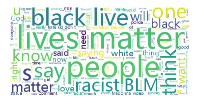
Figure 1: A word cloud image generated from the text marked with "Non hope speech" in the English training data set provided by the task organizer.