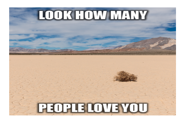
Figure 1: A meme where only after focusing on both text and image, negative sentiment can be identified.

to spread humorous content, but due to its multimodal nature, some memes help users to spread hate speech in the form of dark humor. On social media, posting such memes to troll, cyberbully, or targeting someone is increasing rapidly. Unlike other multimodal tasks (e.g., Visual Question Answering, Image Captioning, etc.), in sentiment analysis for memes, textual and visual information are very weakly semantically aligned. In such a situation, we cannot uncover the complex meaning of hateful content until we get to know both the modalities and their contributions in any content hateful. Analysis of such memes can bring valuable insights that are not explored yet. For example, if there is a meme with text containing "Look how many people love you." The sentiment of this meme can, itself, be positive, negative, or neutral. The sentiment can only be found if and only if we add an image to it (c.f. Figure 1). Some memes are purely humorous, while others spread offensive content in the form of dark humor, sarcasm, mockery, etc. Sentiment analysis of memes in a more effective way will facilitate combating such social media issues.