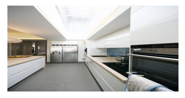
Figure 2: Example Image for Dataset Preparation

Therefore, human annotators are employed to correct Google translated sentences to remove errors. The inter-annotator agreement was 87% between two annotators. Figures 2 and 3 display a sample from the dataset that was created.