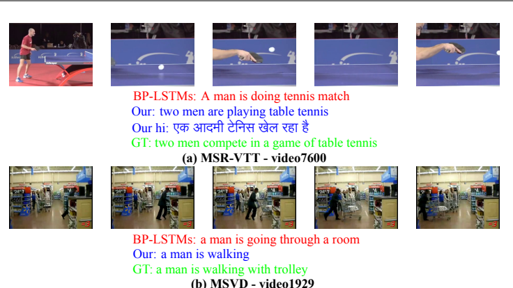
Figure 2: Sample videos selected from each dataset with their ground truth (GT) and generated output