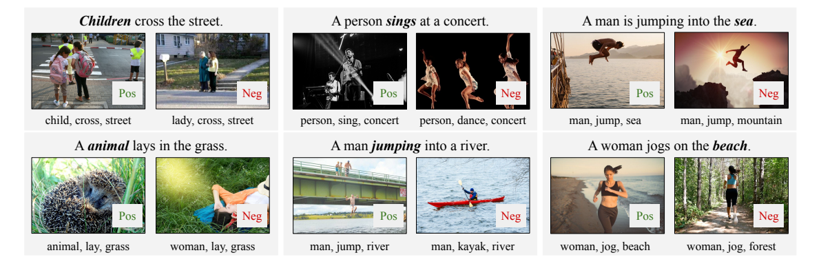
Figure 1: Examples from SVO-Probes. Images on the left and right show positive and negative image examples for each sentence. Below each image is the (subject, verb, object) triplet corresponding to the image.

match; the image-language transformers overpredict that sentences corresponds to images.