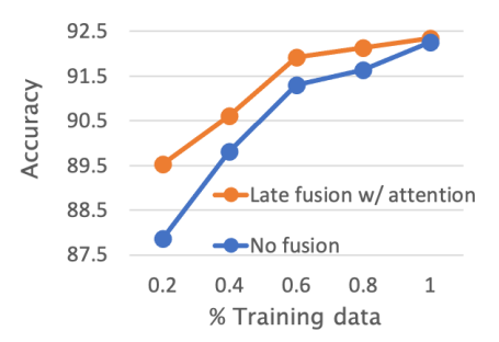
Figure 3: Accuracy vs. Training data size on i2b2 Med. We randomly sample 20\%, 40\%, \cdots, 100\% of training data and report micro- F_1 score averaged over 3 random seeds.

Low-resource setting We evaluate late fusion by reducing training data size from 100% to 20%. Fig. 3 shows late fusion gains more when less training