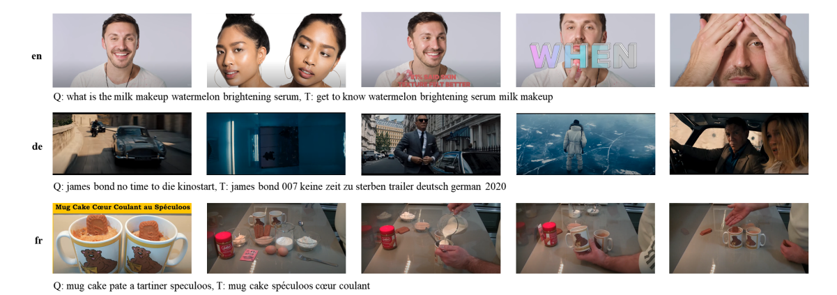
Figure 2: Examples in GEM-V dataset: Q: Query, T: Title.

For understanding tasks, multilingual masked language modeling, multimodal masked language modeling, masked region modeling and visual-linguistic matching are used as pre-training tasks to train a Transformer-based encoder. For generation tasks, multilingual denoising auto-encoding, image captioning and denoising image captioning are used as pre-training tasks to train a Transformer-based encoder-decoder. By training the encoder and the encoder-decoder with a multitask learning framework, universal representations are learned to map objects occurred in different modalities or expressed in different languages to vectors in a common semantic space.