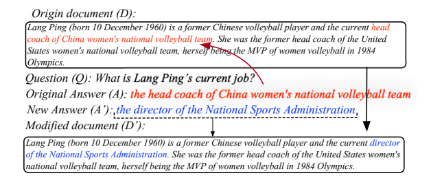
Figure 1: The original text D is in the upper box. The question Q to D has an answer A (in red; its rationale in D also in red). If we would like to change the answer to the new answer A' (in blue), then we have to change some content in D, yielding the modified text D' (with the new content in blue) in the lower box.

Usually, the place of specific content ("where to edit") can be located by a question, and the content updating ("how to edit") can be determined by the answer of the question. Therefore, in this paper, we propose the new task of controllable text edition (CTE). In this task, we would like to achieve the following goal: adjust some content of a document D, to make the answer A of a document-related question Q changed to a new answer A'. For example,