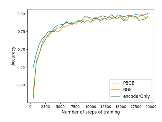
Figure 3: Comparisons of different encoder classifier accuracies against the number of steps the model is trained on.

We also investigate if we can achieve higher performance on the encoder classification if we train with the multi-task objective. From Figure 3 we see that all the models achieve a similar test performance after 3 epochs of training. However, it is interesting to see that the classifier achieves better performance in the initial steps of training with both the PBGE and the BGE models. The comparison is made with respect to taking an off the shelf Bert model and training with the encoder objective described in Section 3.2.1.