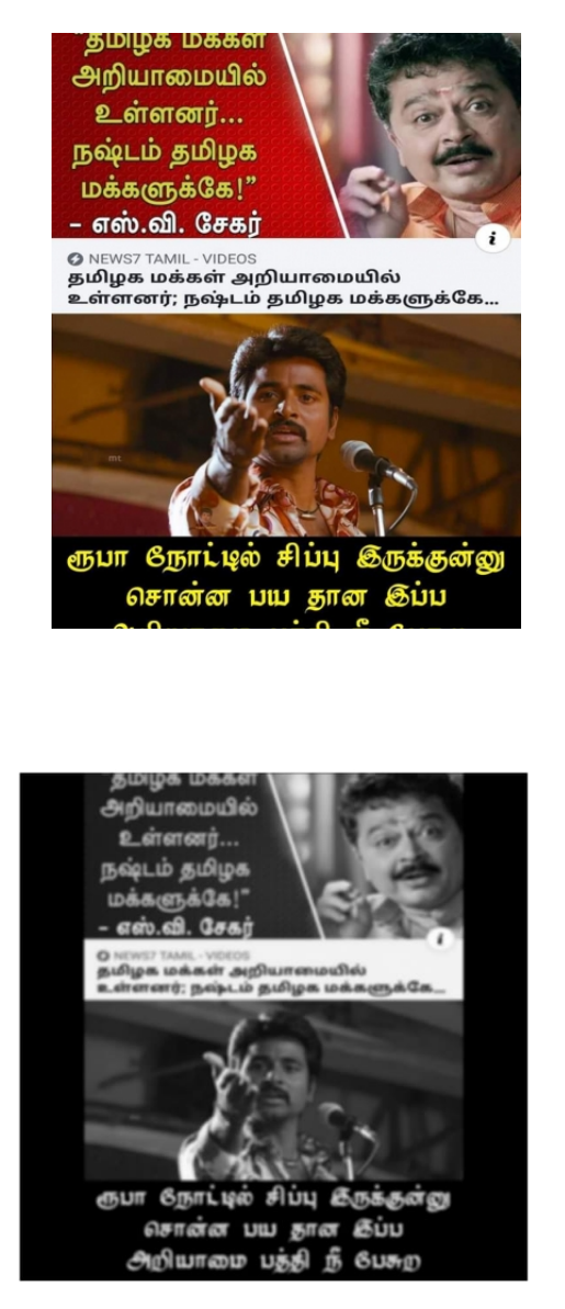
Figure 3: An example of gray-scale image from the dataset

First, we resized each image into an equal shape of a vector (200,200,3). Image processing usually requires a lot of resources. To avoid the resource scarcity problem we converted the colored images into gray-scale. Figure 2 and 3 shows an example of color image and gray-scale image. The grayscale image was finally applied with denoising steps to make the image smoother and noise-free.