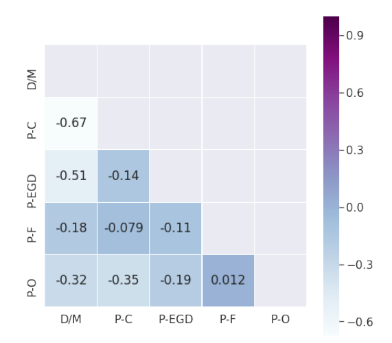
Figure 2: Normalized pointwise mutual information between categories in the question type annotations. Values close to 0 represent variables whose distributions are independent, values above 0 (up to 1) represent pairs of variables that are more likely than chance to occur together, and values below 0 (down to -1) represent pairs of variables that are less likely than chance to occur together.