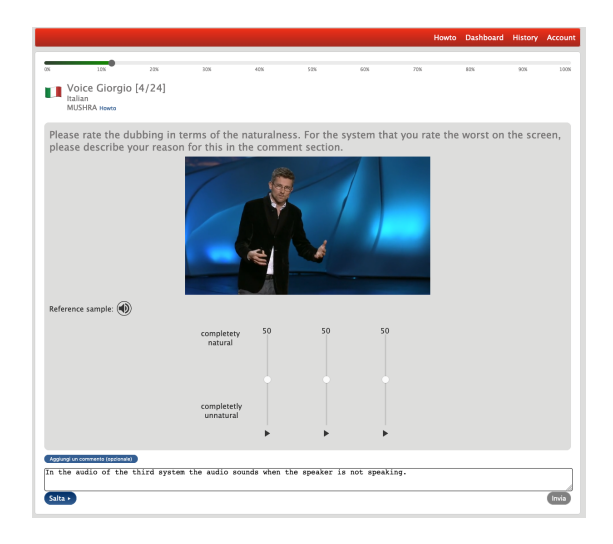
Figure 2: MUSHRA perceptual evaluation interface