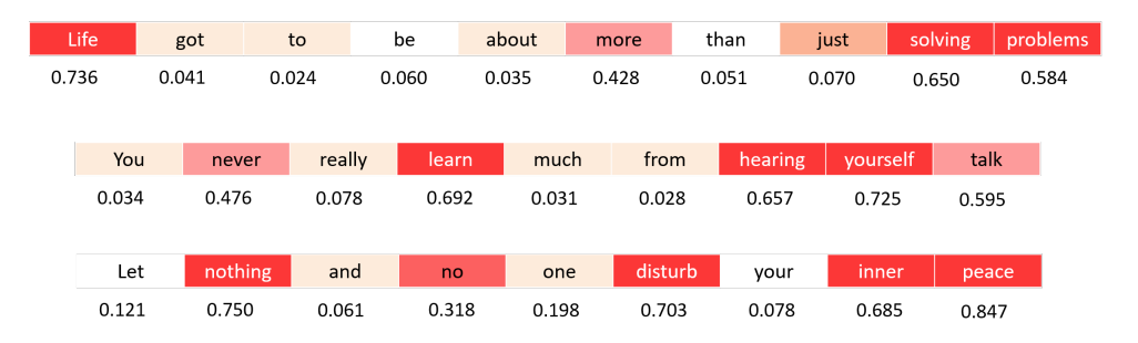
Figure 4: Emphasis Heatmap for test set samples with word probabilities from EmpLite