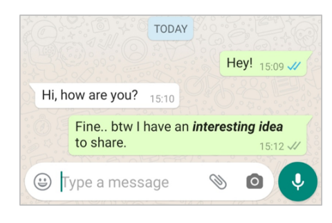
Figure 1: Prominent words in a message are being emphasized ( \mathbf{Bold} + \mathit{Italic} ) automatically

Emphasizing words or phrases is commonly performed to drive a point strongly and/or to highlight the key terms and phrases. While speaking, speakers can use tone, pitch, pause, repetition, etc. to highlight the core of a speech in the minds of an audience. Similarly, while writing or messaging, authors can emphasize the words by customizing the formatting like typeface, font size, bold, italic, font color, etc. as illustrated in Figure 1. With the